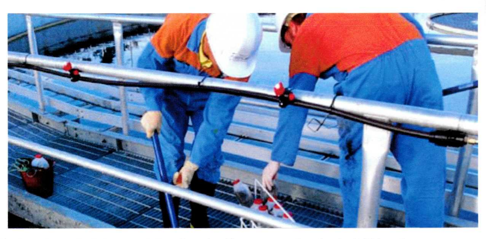
A growing need for infrastructure in Australia, such as this wastewater reclamation plant in Brisbane, is providing a wide array of projects for CH2M HILL.